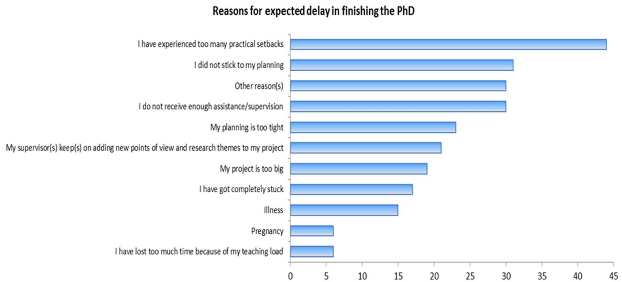
Figure 3. Possible reasons for a delay in finishing the PhD. doi:10.1371/journal.pone.0068839.g003